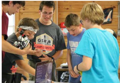
Quick Camp Facts Dining Method Dining Hall