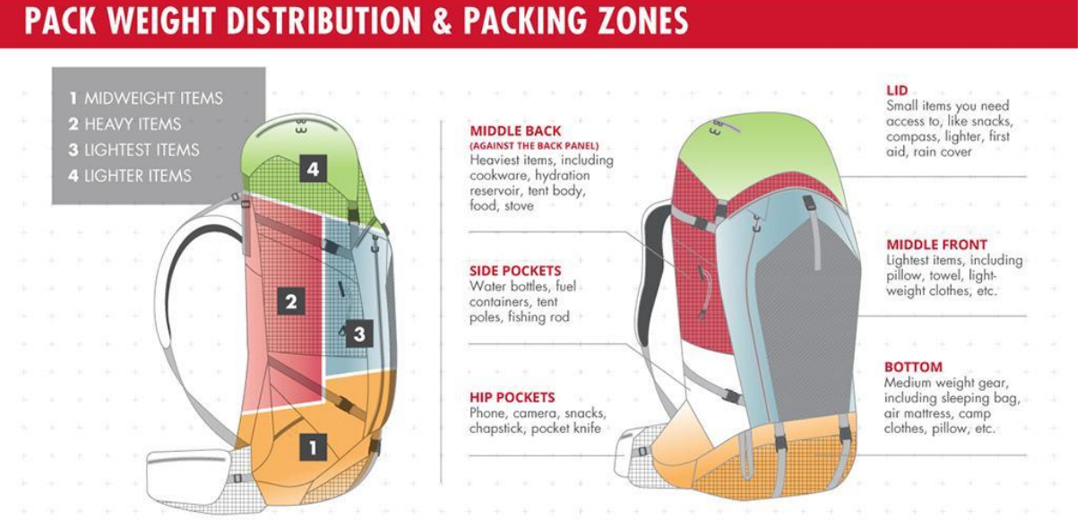
"How to Pack a Backpack" (MSR, 2021)

When packing your gear in your pack for the trail, ensure that you leave enough space for shared crew gear, water, and food (approx. 10 liters). Plan to carry enough water, personal equipment, crew equipment, and crew food for 2 ½ days.